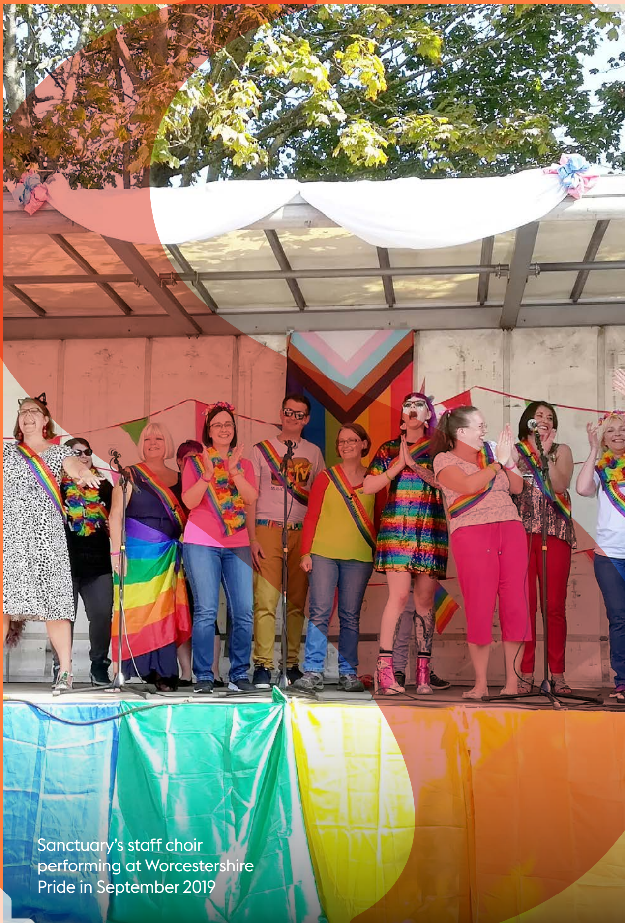
Sanctuary's staff choir performing at Worcestershire Pride in September 2019